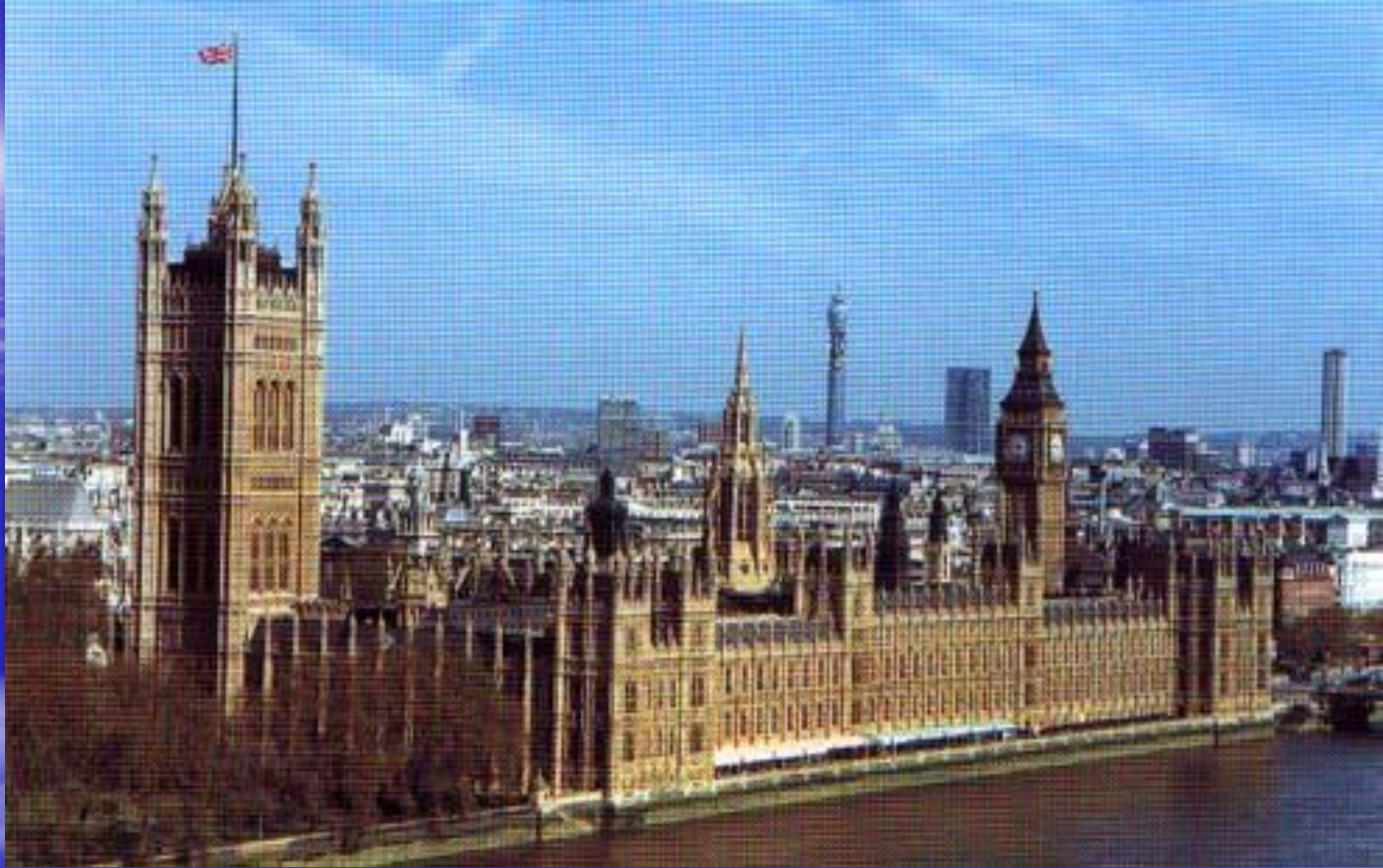
The Houses of Parliament