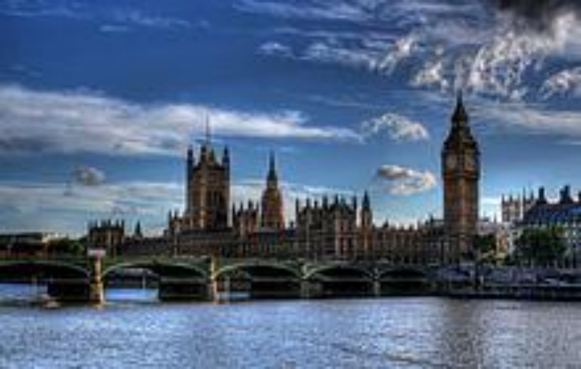
Palace of Westminster, the seat of the both Houses of Parliament of Great Britain