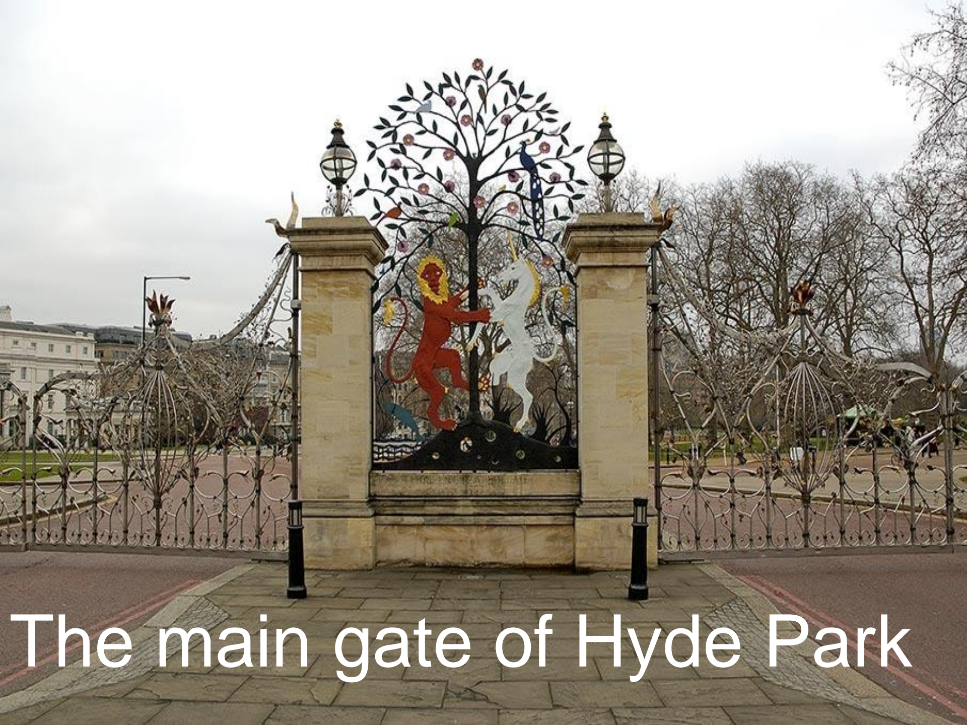
The main gate of Hyde Park